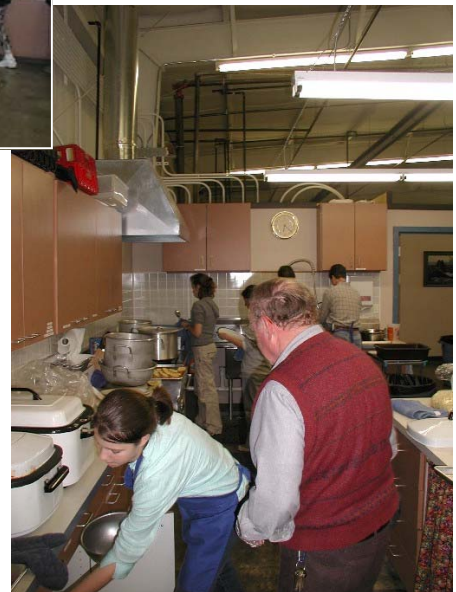
Friday night's are very busy in The River Food Pantry kitchen.