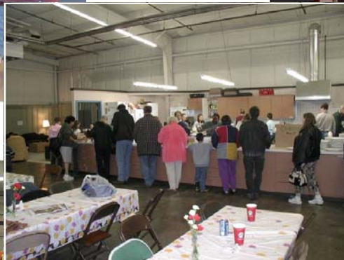
The serving line for Friday night's dinner.