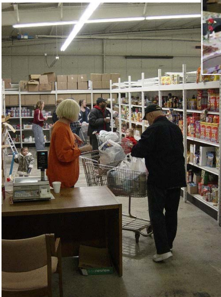
First night of The River Food Pantry's opening.