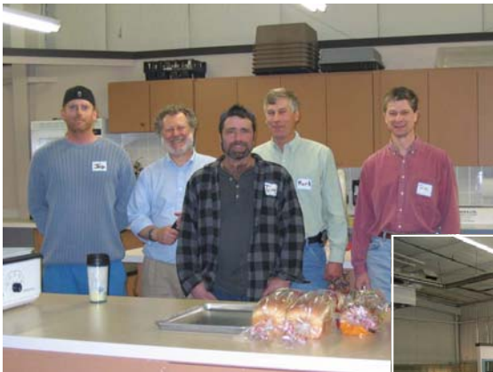
First night's kitchen crew!