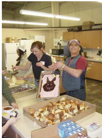
Time for desert!