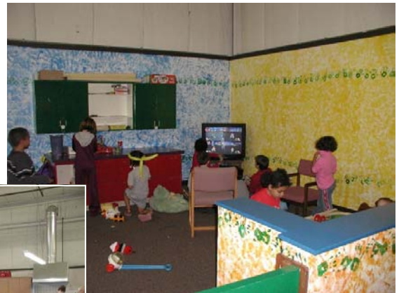
The children's area.