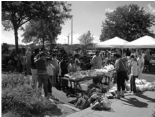
School supplies being handed out at the Mad City/Northport "Back to School Picnic."

"NONE OF THIS WOULD HAVE BEEN POSSIBLE WITHOUT THE INCREDIBLY GENEROUS AND LOVING HEARTS THAT MAKE UP MAD CITY CHURCH."