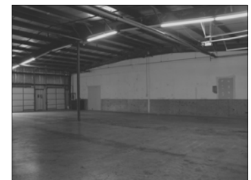
8,000 square feet of space ready to go!