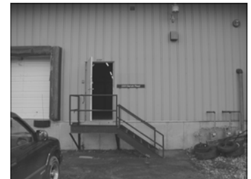
Front Entrance of The River Food Pantry.

This is a work in progress, so we'll continue to keep you updated on our progress!